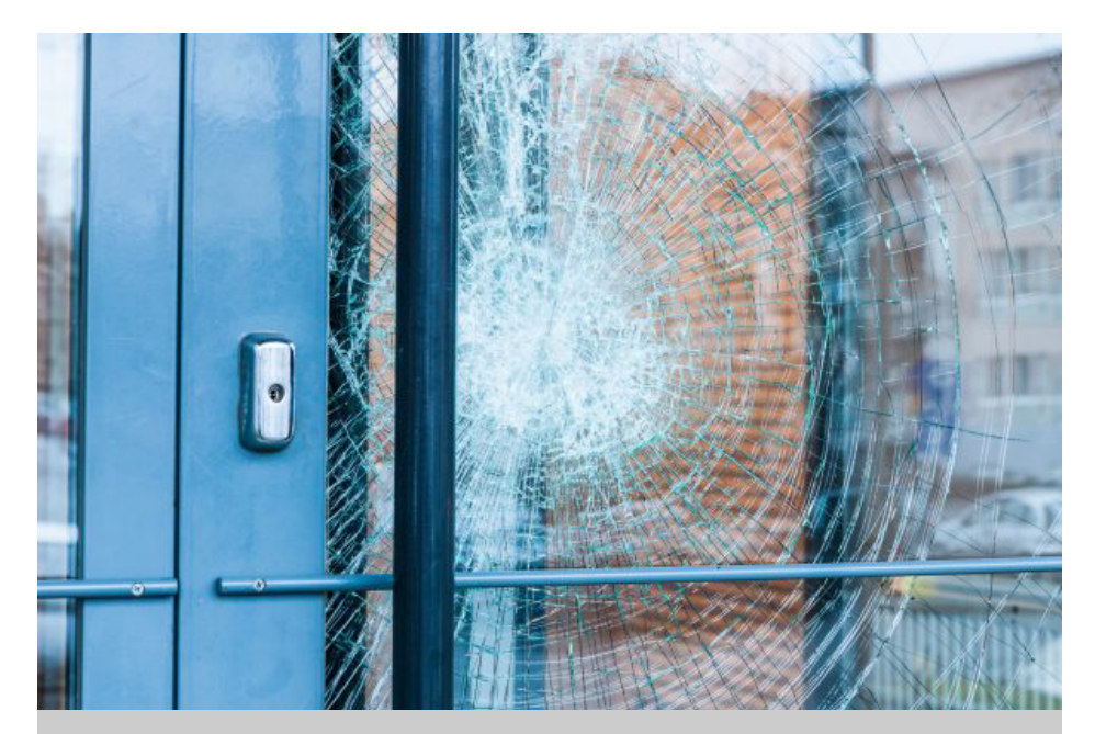
Laminated glass offers the security without the home looking like it has been fortified for a siege.

Resistance to forced entry is important to most homes and businesses. Especially those whose entrances are readily accessible from the street. But also more remote summer or winter getaway properties that may only be occupied for a few weeks in the year.