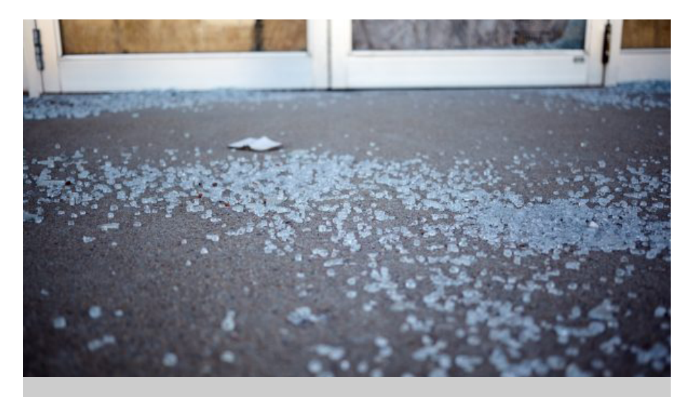
Laminated glass holds the shards together when broken under impact. Unlike tempered glass which breaks into thousands of small pieces.

Hurricanes or high winds are an obvious example but a person walking into a glass door is more common than many people think. We've all heard stories of Uncle Joe at the family barbeque on his third pint of Guinness walking slap dab into the living room glass sliding door, right?